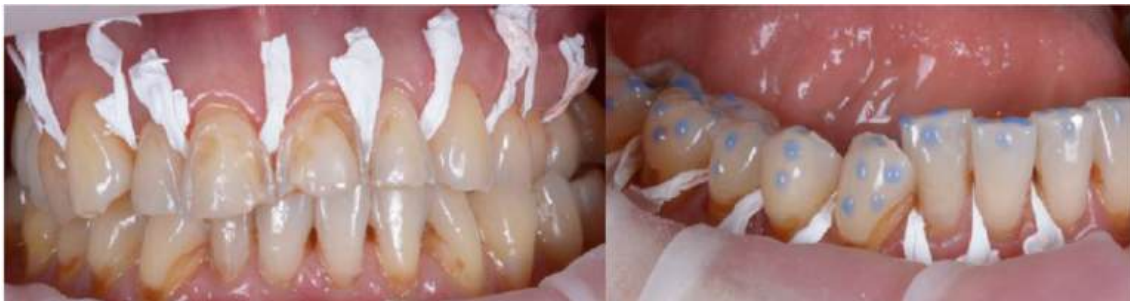
Figure 6. Selective etching of surfaces and application of adhesive system for better mock-up stability.

To describe the details of the proposed method, regarding the treatment of the frontal sectors of both arches, we report below a demonstration clinical case. The treatment plan proposed in this clinical case perfectly mirrors the procedure proposed in the previous paragraph (Steps I-II): treatment planning by wax-up, mock-up, and set-up: the performance of wax-up and mock-up allows for the visualization of the final result and three-dimensional assessment of the orthodontic movements required for the purpose of optimal use of the available dental structures, minimizing the invasiveness of the final restoration (Figures 6 and 7).