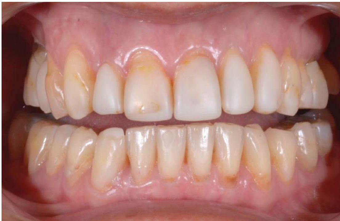
Figure 9. Result after 6 months of aligners.

Prosthetic finalization (Step V): This phase involves the aesthetic and functional reconstruction of the arches through the placement of definitive restorations by employing adhesive techniques. The choice of materials for reconstruction is a point of fundamental importance, in order to be evaluated according to the needs of the individual patient, favoring an attitude as conservative as possible. If the technique has been correctly performed in each step, the exact correspondence with the functionalized mock-up will be verified (Figure 10).