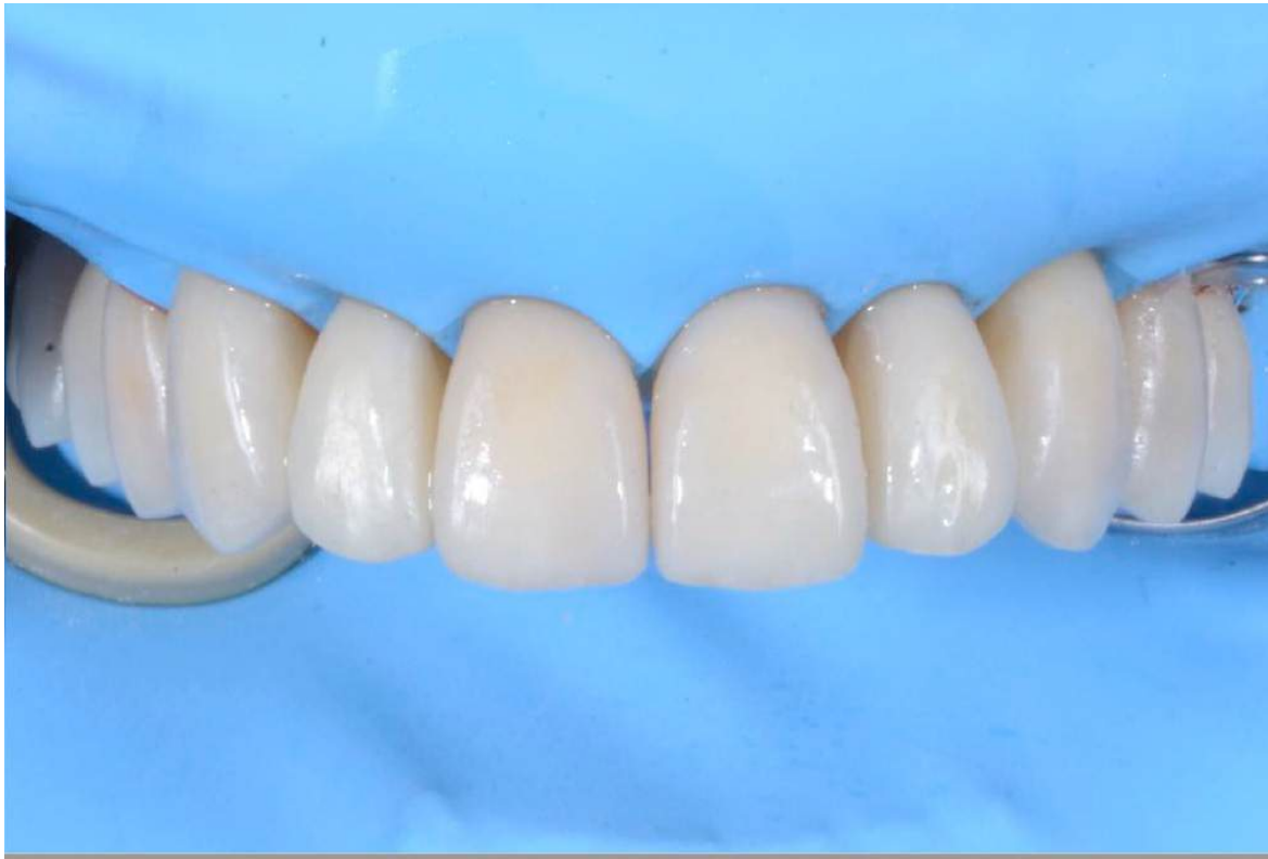
Figure 10. Adhesive cementation of prosthetic artifacts (overlays, onlays, and veneers) using an adhesive technique, dry field.