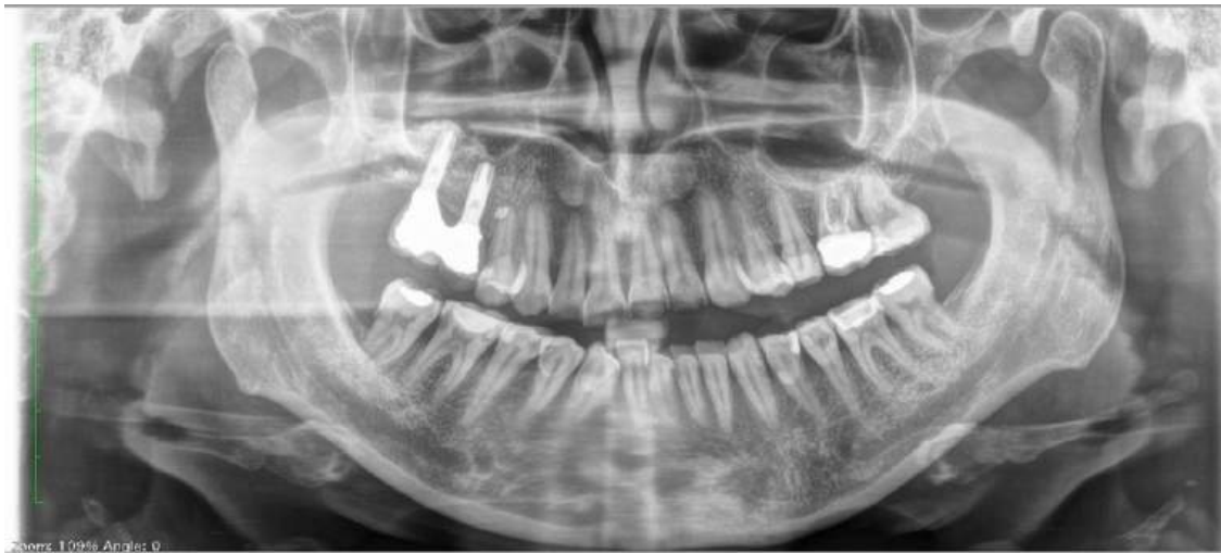
Figure 4. Pretreatment panoramic radiograph.

Clinical and radiographic examinations revealed a good status of the periodontal tissue (Figures 4 and 5).