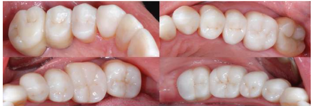
Figure 13. Details of posterior quadrant reconstruction with recovery of the vertical dimension, chewing efficiency, and aesthetics.

The correct execution of the orthodontic-conservative procedure allowed us to achieve, with excellent approximation, all the planned goals (Figure 14). Stability of outcome was confirmed by a clinical and radiographical follow-up at 2 years after the finish of therapy (Figures 15 and 16).