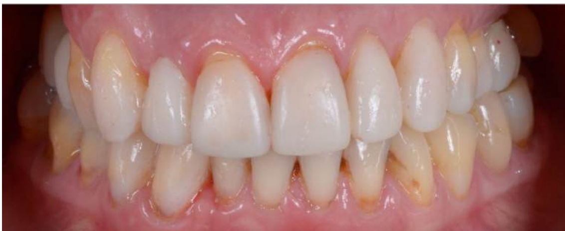
Figure 7. Initial mock-up made without tooth preparation (additive approach) through the use of a self-curing composite resin.

Set-up and orthodontics (Steps III-IV): The orthodontic step is the next step after mock-up creation and the creation of a clinical validity of vertical dimension elevation. Each new aligner will exert different pressure on individual teeth, programmed with the digital set-up. It will be the clinician's job to perform stripping and occlusal retouching of the mock-up to allow the teeth to move in the predetermined direction and amount (Figure 8). After 6 months of aligners, the goals of orthodontic treatment have been achieved, and the case is ready for finalization (Figure 9).