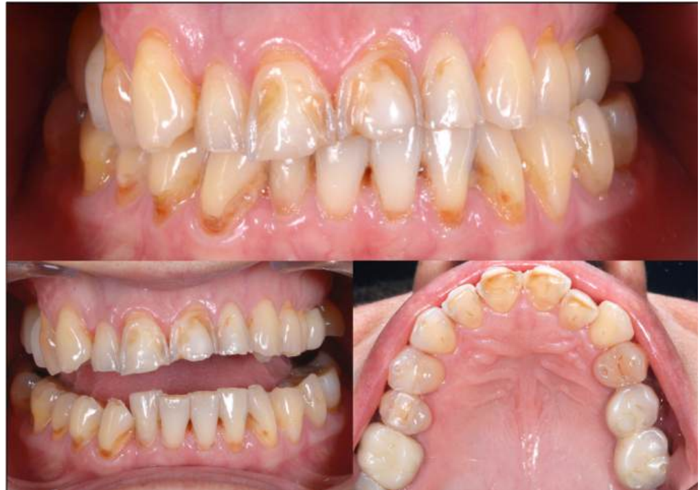
Figure 1. Intra-oral photos showing the extensive erosion of the frontal teeth.

In addition, posterior cross bite and misalignment of the anterior sector were present in the upper arch, while in the lower arch, there was anterior crowding. Moreover, incongruous conservative and prosthetic treatments were visible at the occlusal surface of the posterior sectors (Figure 2). It was also observed that occlusal changes that occurred because of the extensive tooth erosions compromised the physiological occlusal dynamics in protrusion and lateral movements (Figure 3).