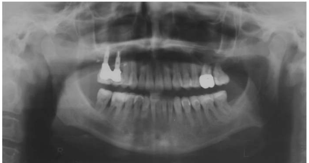
Figure 16. Orthopantomography at 24 months.