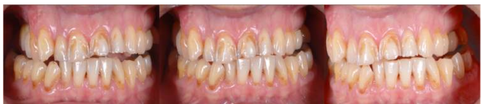
Figure 3. Occlusal changes that occurred as a result of the extensive tooth erosions compromised the physiological occlusal dynamics in protrusion and lateral movements.