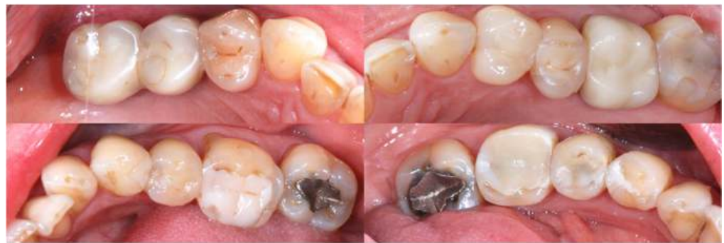
Figure 2. Incongruous conservative and prosthetic treatments visible at the occlusal surface of the posterior sectors.