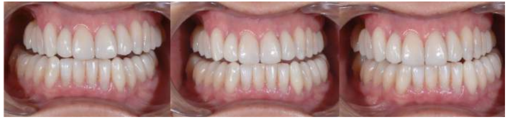
Figure 12. Physiological occlusal dynamics in protrusion and lateral movements.