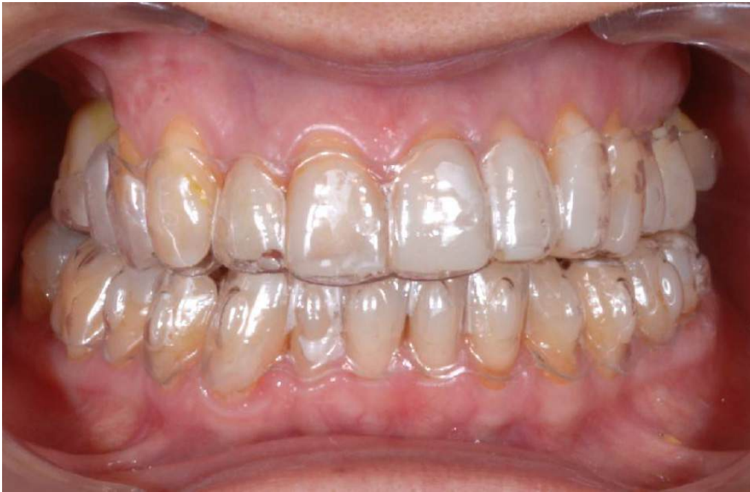
Figure 8. Orthodontic treatment with customized aligners based on the mock-up.