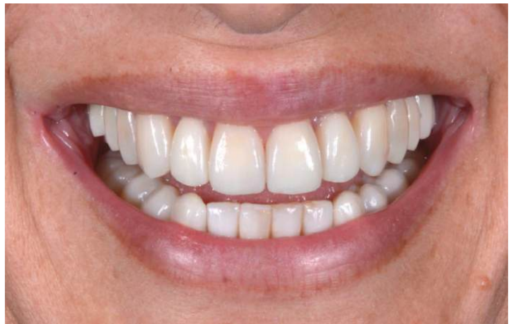
Figure 14. Details of posterior quadrant reconstruction with recovery of the vertical dimension, chewing efficiency, and aesthetics.

The correct execution of the orthodontic-conservative procedure allowed us to achieve, with excellent approximation, all the planned goals (Figure 14). Stability of outcome was confirmed by a clinical and radiographical follow-up at 2 years after the finish of therapy (Figures 15 and 16).