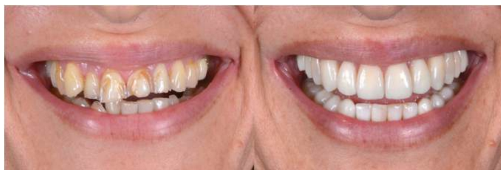
Figure 11. Comparison of the initial and final situation.

Orthodontic treatment and anatomical reconstruction of eroded teeth allowed us to create the reconstitution of physiological occlusal dynamics (Figures 12 and 13).