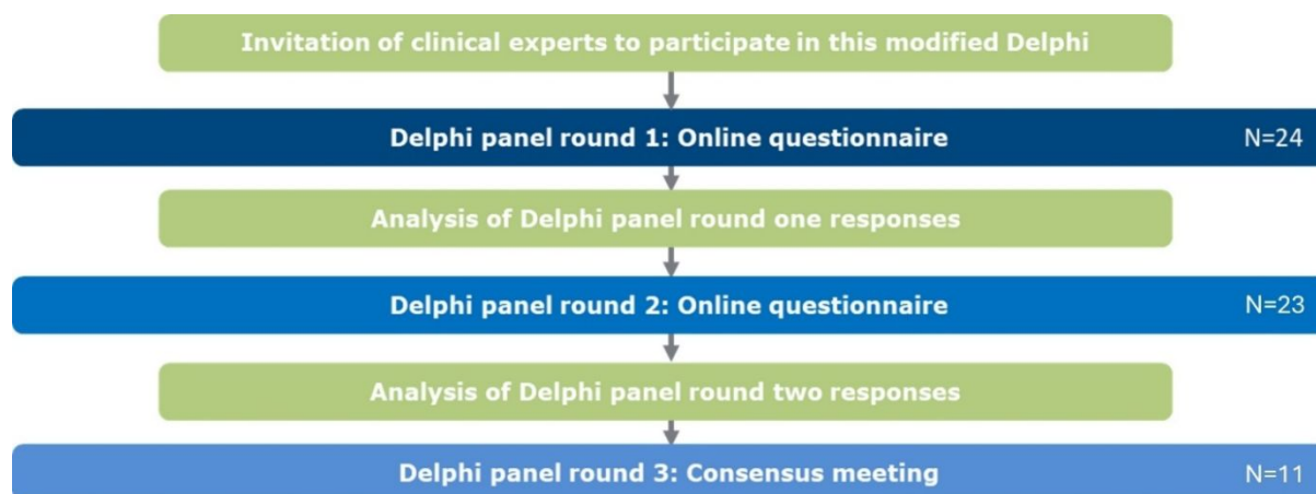
Figure 1. Overview of modified Delphi methodology

The first-round survey included 20 physicians and four nurse practitioners. The second-round survey included 19 physicians and four nurse practitioners. The consensus meeting only included physicians.