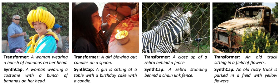
Fig. 2. Qualitative comparison between SynthCap and the baseline on sample images from the COCO dataset.

seeds. Also in this setting, SynthCap achieves the best results according to all evaluation metrics. Finally, in Fig. 2, we show some qualitative results on sample images from the COCO dataset, comparing captions generated by our model with those generated by the baseline without synthetic data augmentation.