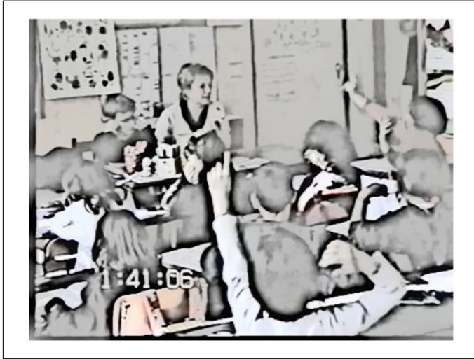
Figure 2. T. delivers the incremental question in l. 5.