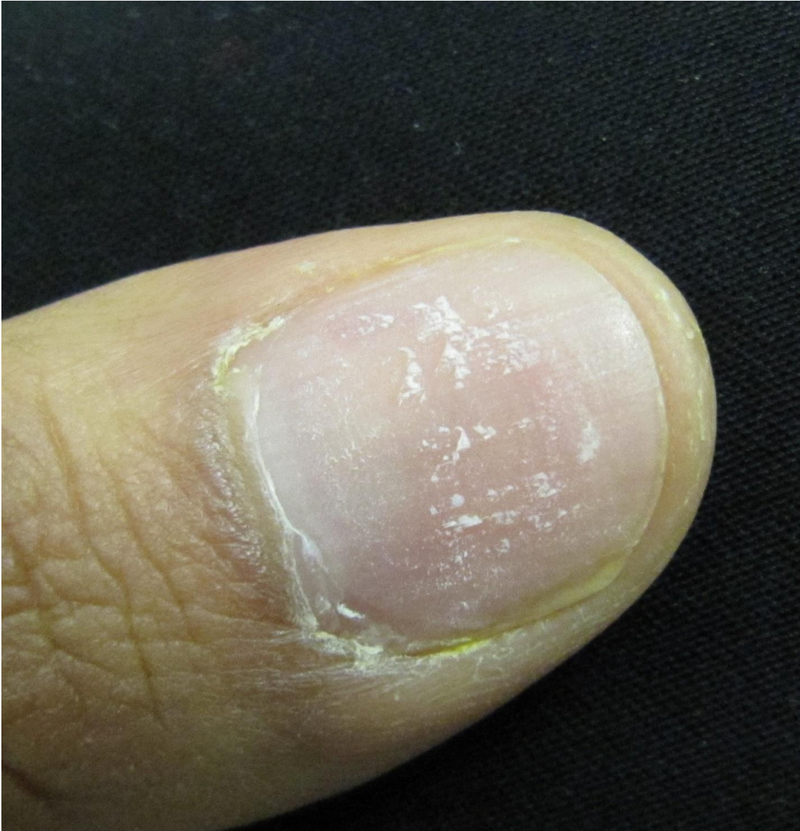
Figure 3: The 'flaky' appearance of the nail plate surface after tape stripping. This volunteer received a total of 15 tape strips, at which point he felt discomfort and tingling.