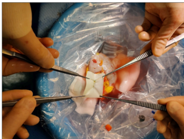
Figure 2. Reconstruction of double artery on a bovine pericardium patch.

first case an angiomyolipoma and in the second and third case a clear cell carcinoma (diameter 2.2 cm, G1 and diameter 2 cm, G2 respectively). At a mean follow-up of 33.2 months, both donors and recipients have no recurrence. The median hospital stay was three days (IQR 2-10) without any re-admission. In the evening of the day of surgery, the donors were allowed to drink clear fluids. When the postoperative course was regular, urinary catheters and surgical drain were removed within the first and the second postoperative day (POD). In one case, urinary catheter was replaced and removed in 3 rd POD for bladder globe due to a known prostatic hypertrophy. Four patients (10.5%) experienced postoperative complications: 2 cases of chyle fistula, 1 case of urinary infection and 1 case of postoperative paralytic ileus. All cases were treated conservatively (Clavien-Dindo complication grade