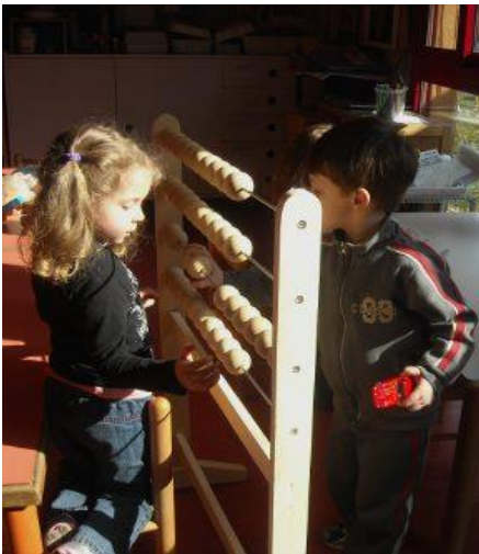
Figure 2: The giant Slavonic abacus

At the beginning of the second year of activity (2008/09) all the municipal preschools were given a giant Slavonic abacus. Teachers themselves had designed it with forty beads because this number meets the most common needs of school activity (e.g. counting children in the roll, counting the days per month in the calendar). The large size fosters large body gestures (even steps) to move the beads. Intentionally, schools received a dismantled abacus, as most teachers agreed that the very assembling could have been an important part of the exploration of the artefact.