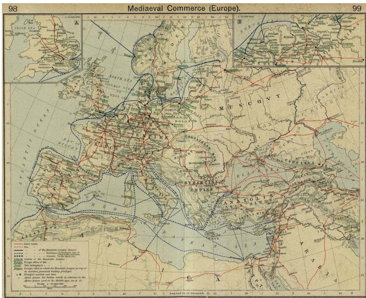
Figure 1. Medieval commercial routes in Europe

For our dependent variables, we collect enrollment rates by gender for the population of primary school age, which consists of the population between 6 and 12 (excluded) years of age. On this basis we calculate a measure of gender equality given by the female to male ratio in enrollment rates. This measure is equivalent to the UN definition of the Gender Parity Index, where 0 corresponds to extreme inequality and 1 to full equality. While our focal variable refers to such ratio for the non compulsory upper primary level, for the sake of comparison we also keep track of it for the lower and aggregate primary levels. 14 Beside data by gender, we also include general indicators of schooling defined as the number of pupils enrolled in primary school over the number of children of the corresponding 6-12 school age, again available at the upper, lower, and aggregate primary levels. 15