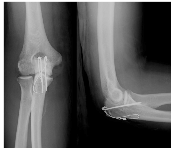
Figure 3 Postoperative radiographs showing the double drilling in the proximal part of the ulna. Olecranon avulsion fixed with a Zuggurtung tension band technique.

distal triceps tendon detachment [5]. Clinical assessment is fundamental to diagnose the rupture. Imaging (plain radiographs, ultrasounds and MRI) is important in the diagnosis and preoperative assessment to detect the partial forms avoiding the change into chronic forms. Treatment depends on the extent of tendon rupture, preoperative level of activity performed by the patient and his or her age. Surgical repair remains controversial in partial tendon ruptures and often good results are obtained with conservative treatment: surgical repair has been the mainstay of treatment for most acute tendon ruptures in active patients [8]. Several surgical techniques have been proposed for triceps tendon reinsertion, such as the use of anchors, tendon grafts flaps and locking sutures through the tendon edges passed through three drill holes in the olecranon. To the best of our knowledge, the reported surgical technique has not been described in the literature for avulsion of the proximal tip of the olecranon associated with triceps tendon rupture: the use of a double ulnar tunnel to obtain fixation of the olecranon fragment with Zuggurtung tension bands with K wires, associated with a whipstitch locking-type suture for the triceps tendon was demonstrated to be an effective technique to obtain proper fixation of the fracture and optimal reinsertion of the detached tendon on its footprint. The clinical result was satisfactory with full elbow ROM recovery at 30 days postoperatively.