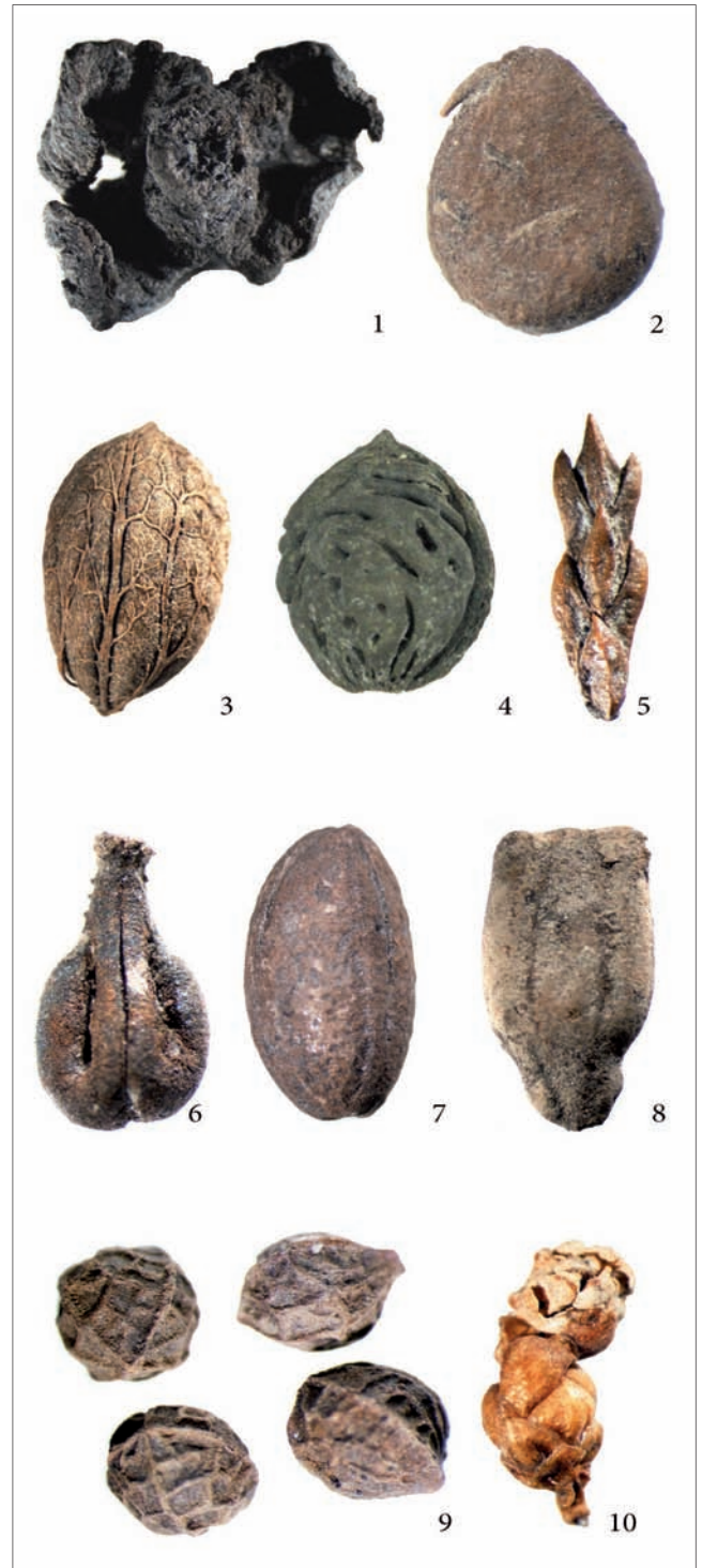
Fig. 2. - Photos of some carpological records: 1) Dyospyros lotus (calyx – 1.8 cm - charred); 2) Morus nigra (endocarp – 3.4 mm); 3) Olea europaea (endocarp – 1.3 cm); 4) Prunus persica (endocarp – 2.1 cm); 5) Cupressus sempervirens (twig – 5.8 mm); 6) Vitis vinifera subsp. vinifera (pip – 6.7 mm); 7) Cornus mas (endocarp – 1.1 mm); 8) Lagenaria siceraria (seed – 14.5 mm); 9) Celtis australis (endocarp – 3.2 mm); 10) Taxus baccata (male flower – 8.5 mm).

grasslands). These features are reported by Appianus (2 nd century AD) in quotations relating to the Civil War, which describe the landscape of Modena as being rich in water, powered by fountains with land cut across by ditches (Calzolari, 2008). Concerning this particular aspect of the wetlands, a study comparing Modena in the Roman Period and in the Middle Ages (Bosi et al., in litteris ) is in progress. Research has revealed a floristic list (Tab. 2) numerically superior than the one available (almost 300 taxa) for the over 30 Roman sites previously studied from a carpological standpoint in Emilia Romagna (Rinaldi, 2010). The floristic list of the Roman Period, compared with the present floristic list of planitial plants of the Province of Modena (Alessandrini et al., 2010), corresponds to about 1/3 of the