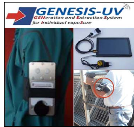
Fig. 1. The GENESIS-UV system for long term occupational UV exposure monitoring

The occupational solar UVR exposure monitoring was performed with the GENESIS-UV (GENeration and Extraction System for Individual exposure) methodology (Fig. 1).