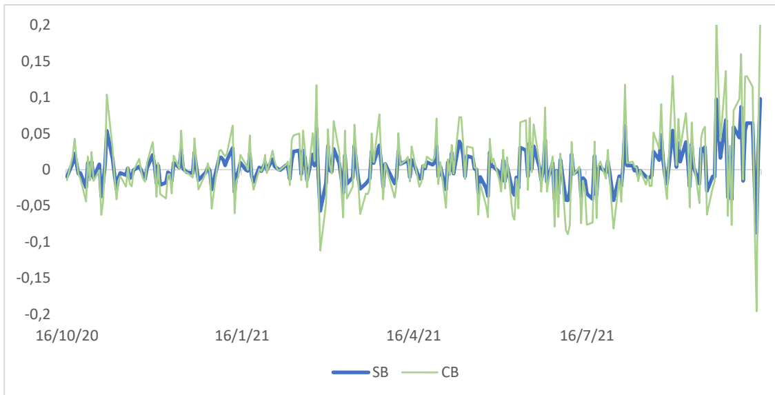
Figure 2 - Daily YTM: SBs and CBs

To sum up, the descriptive analysis of our sample of SB and CB highlights differences in yields and in some of the matched characteristics, and this call for the next multivariate analysis of the determinants of the yield spreads.